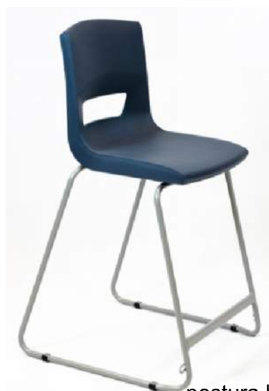
postura high chair and high bench