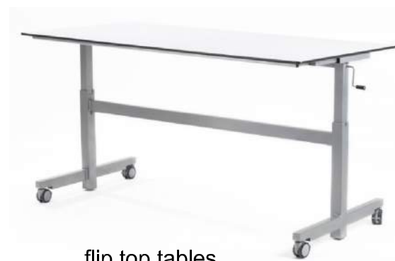
flip top tables