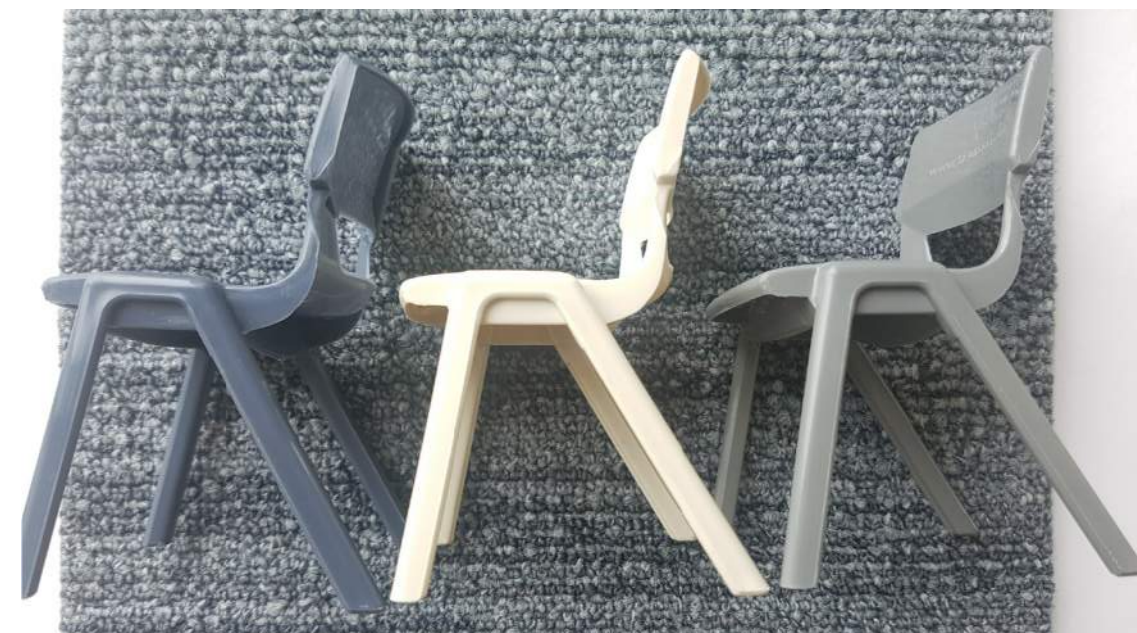
carpet and furniture colour scheme