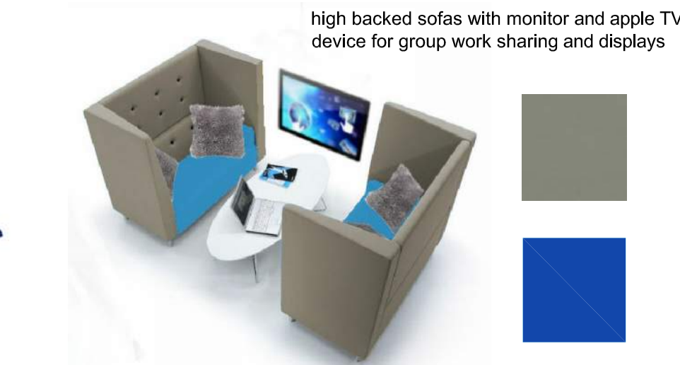
high backed sofas with monitor and apple TV device for group work sharing and displays